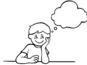
Schema (Background Knowledge)